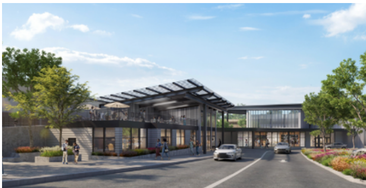
Pictured above is the latest rendering for the Crocker MPR and Campus Renovation

The district continues to wait for DSA comments from the recent submission for the West MPR project. HCSD is very excited about getting this project off the ground and will keep the community posted on next steps!